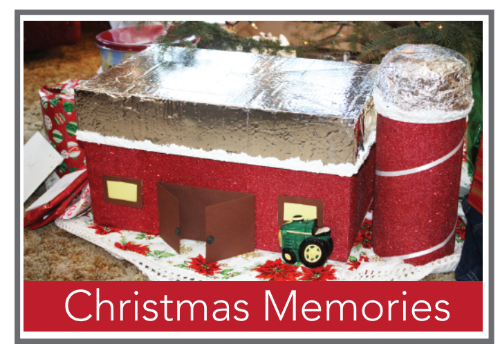
These are some boxes Lorraine decorated to look like a barn with a matching silo. Created for her Dad in 2012

Up until now you needed to find our web site by typing in the address bar on the internet http://www.georgeandlorraine.com. Now you can google us in the search bar by typing only georgeandlorraine.com.